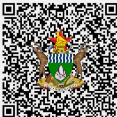
Chief Registrar of Companies

Given under my hand this 7th day of January 2026